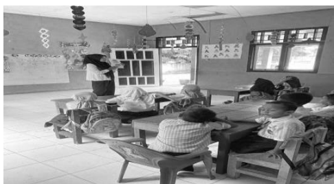
Figure 2. Moral and Religious Values Learning Process Storytelling Activity Cycle I Meeting I

The learning process of moral and religious values through storytelling activities in cycle I meeting I is illustrated in Figure 2. Figure 2 shows that the teacher began implementing the storytelling method by introducing moral and religious messages embedded in the narrative, while the children were observed listening attentively and responding to the teacher’s guidance. During this meeting, some children were able to follow the storyline and respond to questions, indicating initial engagement with the learning activity. However, several children remained passive and still required direct assistance from the teacher to demonstrate appropriate moral and religious behaviors. This finding suggests that, at this stage, the learning outcomes had not yet been optimally achieved and that further instructional support was necessary.