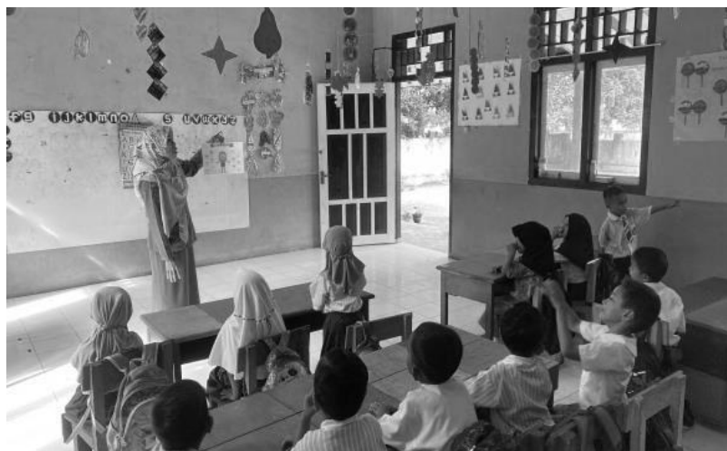
Figure 1. The Process of Learning Moral and Religious Values Pre-Action Storytelling Activity

The learning process of moral and religious values before the implementation of storytelling activities is illustrated in Figure 1. Figure 1 depicts the classroom learning situation prior to the intervention, in which children had not yet actively demonstrated moral and religious behaviors, such as practicing worship, displaying polite behavior, or responding appropriately to moral guidance during learning activities. This condition indicates that the development of moral and religious values had not been optimal before the storytelling method was applied.