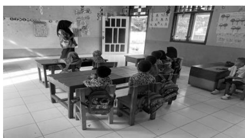
Figure 4. Moral and Religious Values Learning Process Storytelling Activity Cycle II Meeting I

The learning process of moral and religious values through storytelling activities in cycle II meeting I is illustrated in Figure 4. Figure 4 shows that children were more actively engaged in the learning process compared to cycle I. They paid closer attention to the storytelling, followed the teacher’s instructions more consistently, and began to demonstrate appropriate moral and religious behaviors during classroom activities. This improvement indicates that the revised actions implemented in cycle II contributed to more effective learning outcomes.