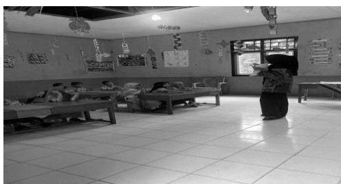
Figure 5. Moral and Religious Values Learning Process Storytelling Activity Cycle II Meeting II

The learning process of moral and religious values through storytelling activities in cycle II meeting I is illustrated in Figure 4. Figure 4 shows that children were more actively engaged in the learning process compared to cycle I. They paid closer attention to the storytelling, followed the teacher’s instructions more consistently, and began to demonstrate appropriate moral and religious behaviors during classroom activities. This improvement indicates that the revised actions implemented in cycle II contributed to more effective learning outcomes.