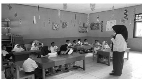
Figure 3. Moral and Religious Values Learning Process Storytelling Activity Cycle I Meeting II

The learning process of moral and religious values through storytelling activities in cycle I meeting I is illustrated in Figure 2. Figure 2 shows that the teacher began implementing the storytelling method by introducing moral and religious messages embedded in the narrative, while the children were observed listening attentively and responding to the teacher’s guidance. During this meeting, some children were able to follow the storyline and respond to questions, indicating initial engagement with the learning activity. However, several children remained passive and still required direct assistance from the teacher to demonstrate appropriate moral and religious behaviors. This finding suggests that, at this stage, the learning outcomes had not yet been optimally achieved and that further instructional support was necessary.